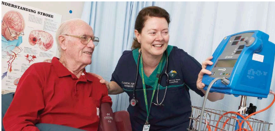
Section Cover (previous page): Pathology lab technician working with samples

Widely acknowledged as one of the world’s leading healthcare centres of excellence, Australia’s healthcare sector is predicted to more than double in coming decades as populations increase, populations continue to age, technologies improve, and lifestyle choices continue to change among consumers.