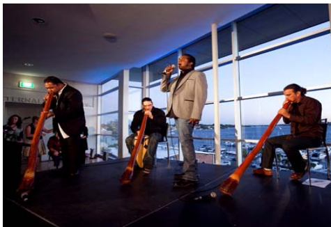
Above: The crowd were in awe. Against a most spectacular backdrop of the sun setting over Freshwater Bay, artists perform at the Bethesda Palliative Care Unit fundraiser.