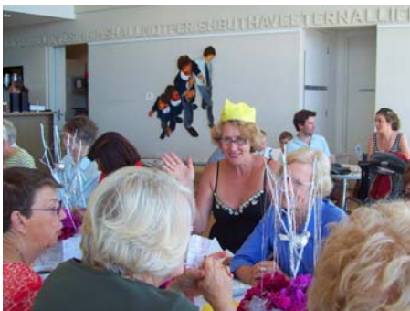
Above: Volunteers enjoy the Annual Christmas Celebration in the Bethesda Café.